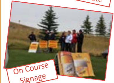
On Course Signage