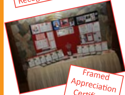
Framed Appreciation Certificate